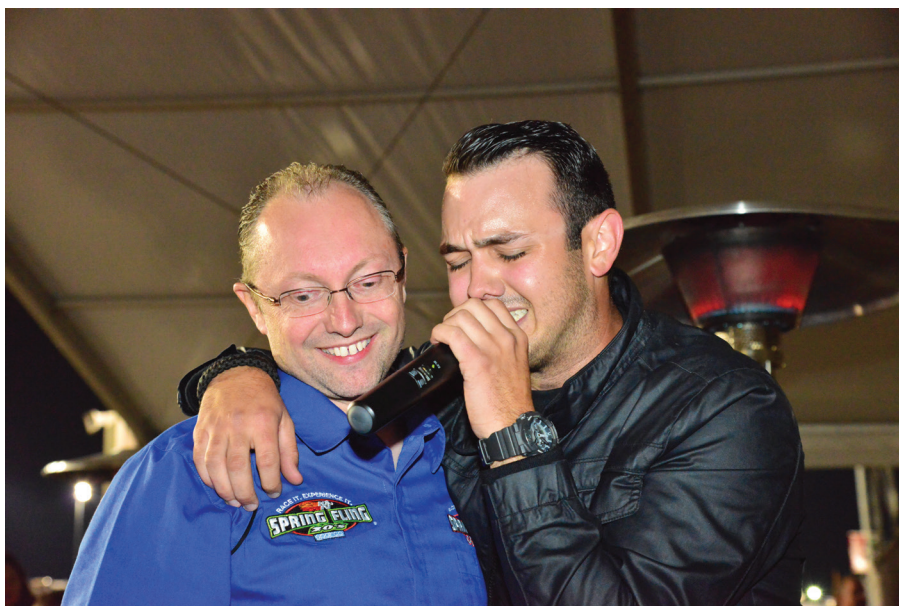
He's played at a number of races and events; Spring Fling, PDRA, NHRA banquets and such; and part of the allure is he's one of us with music relating to the sport.

"In this town I live in; which was one of